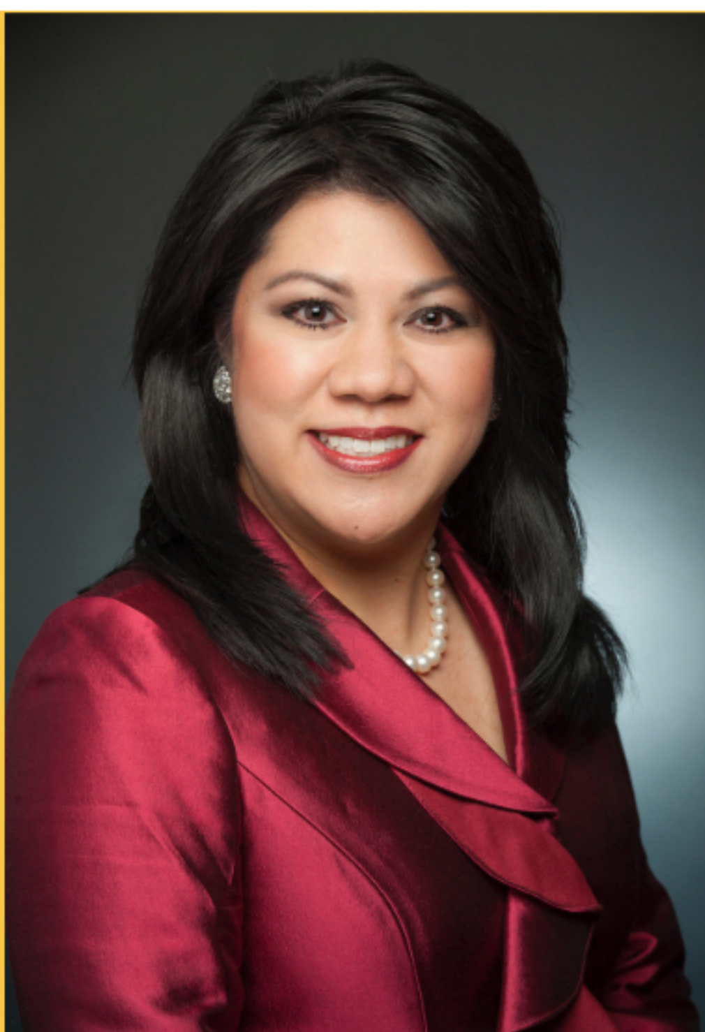
ARIZONA TREASURER KIMBERLY YEE

Treasurer Yee is the first Asian American elected to a statewide office in Arizona's history. She is also the first Chinese American Republican woman to win a major statewide office in United States history. Kimberly Yee was elected to the Arizona Legislature in 2010 and served as the Senate Majority Leader. Kimberly was the second woman elected as Senate Majority Leader in Arizona's history, following U.S. Justice Sandra Day O'Connor who served in the position in 1973. With eight years of experience in the Arizona Legislature, as well as four years working for the Arizona State Treasurer's Office, Treasurer Yee brings a unique perspective to this important financial leadership role for Arizona.